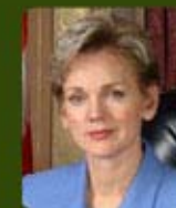
Jennifer Granholm Governor of Michigan